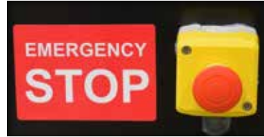
Emergency Stop (E-Stop)