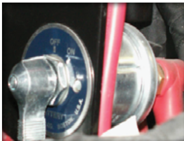
Internal battery disconnect