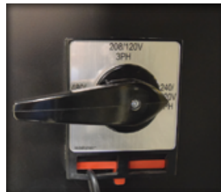
Multi voltage selector switch with lockout