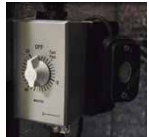
LED internal lighting