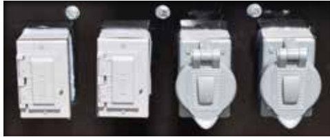
Optional power distribution